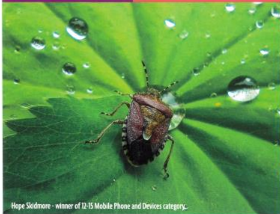
Hope Skidmore - winner of 12-15 Mobile Phone and Devices category.